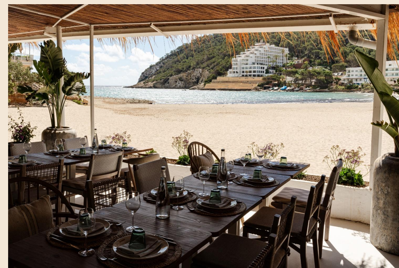
▲ Sonrojo up to 200 people