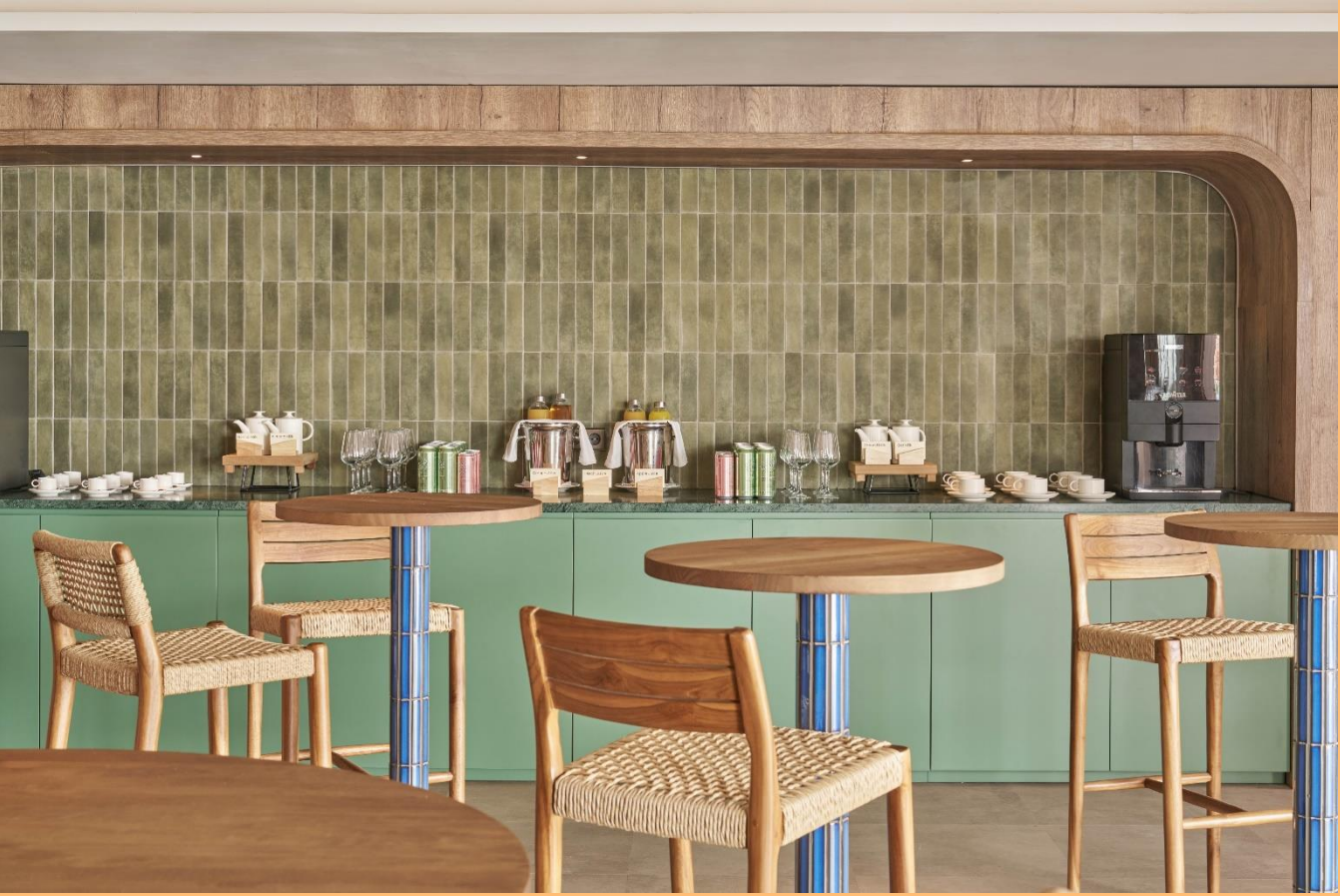
▲ Coffee Break area