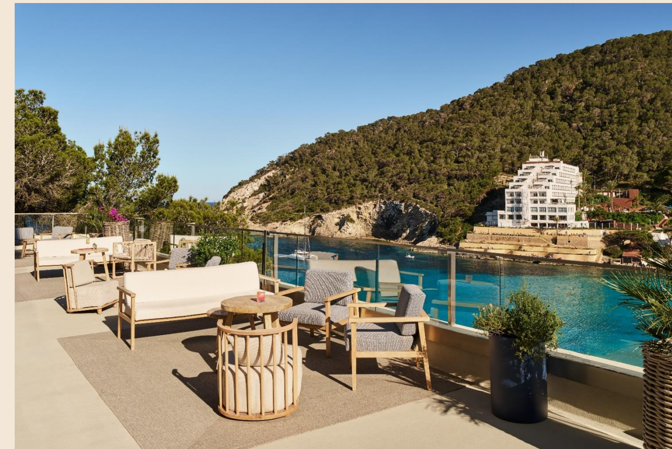
▲ Sun & Moon up to 450 people