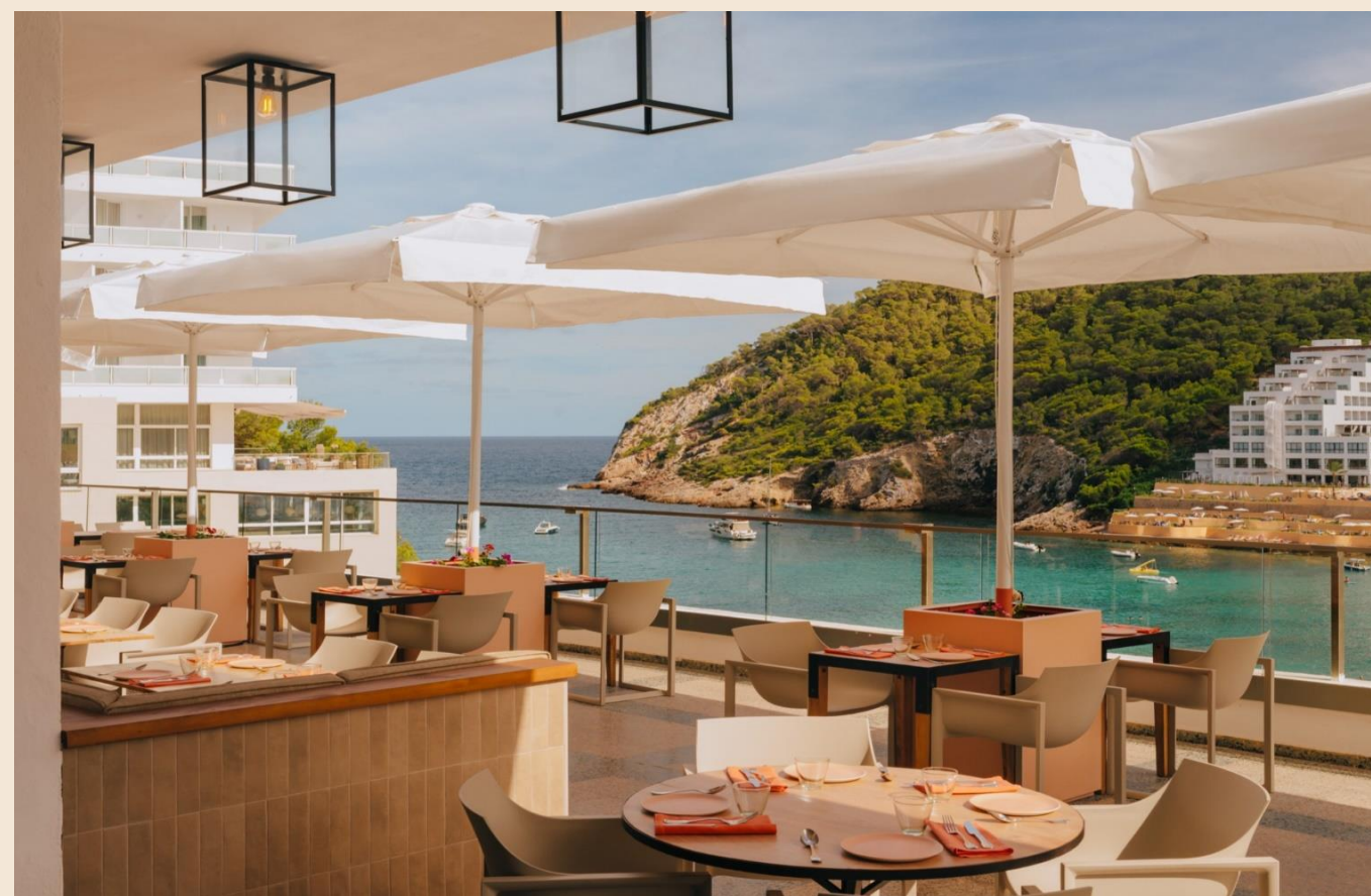
▲ Cuyo up to 600 people