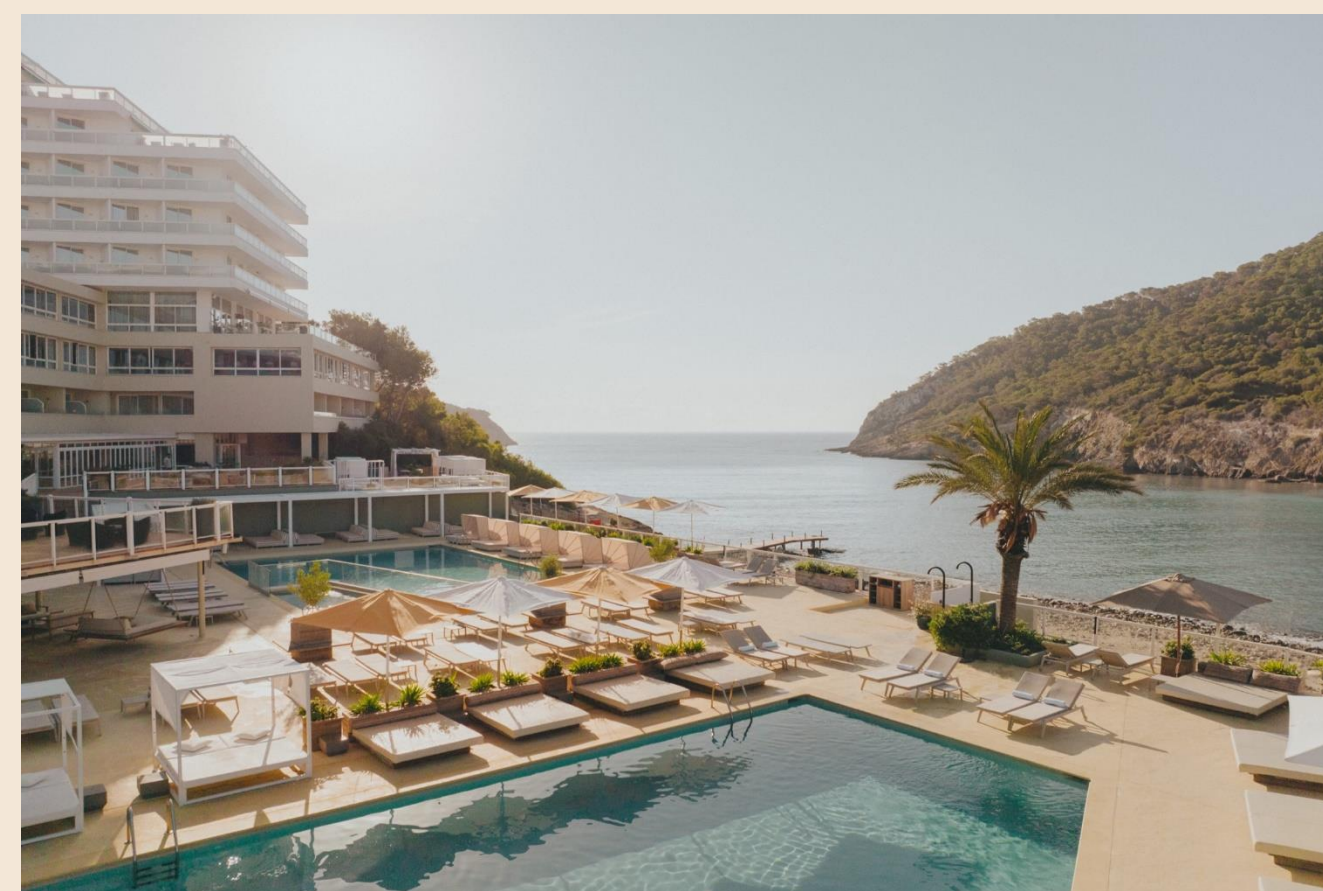
▲ Pools up to 1000 people