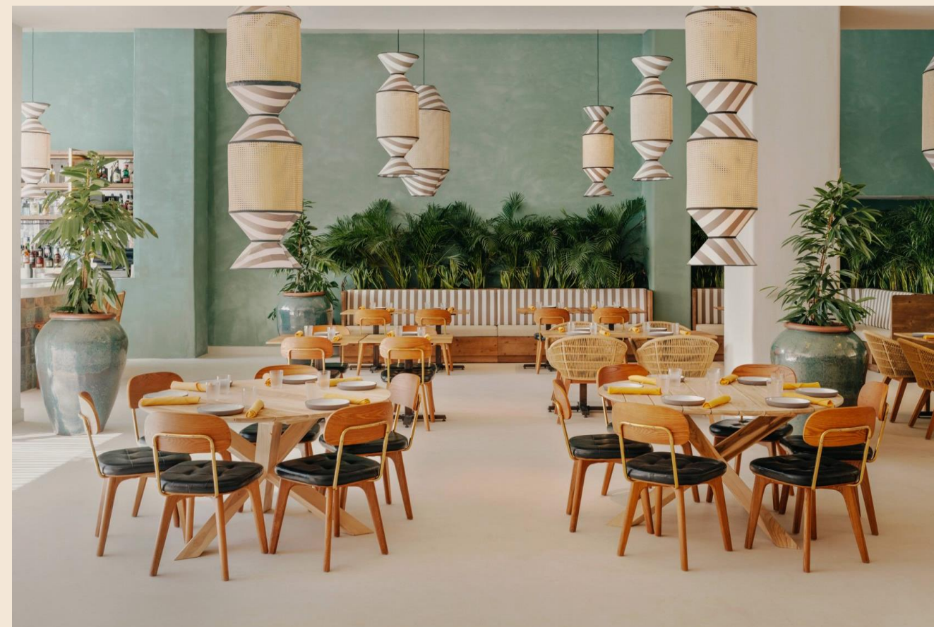
▲ Bungalow up to 200 people