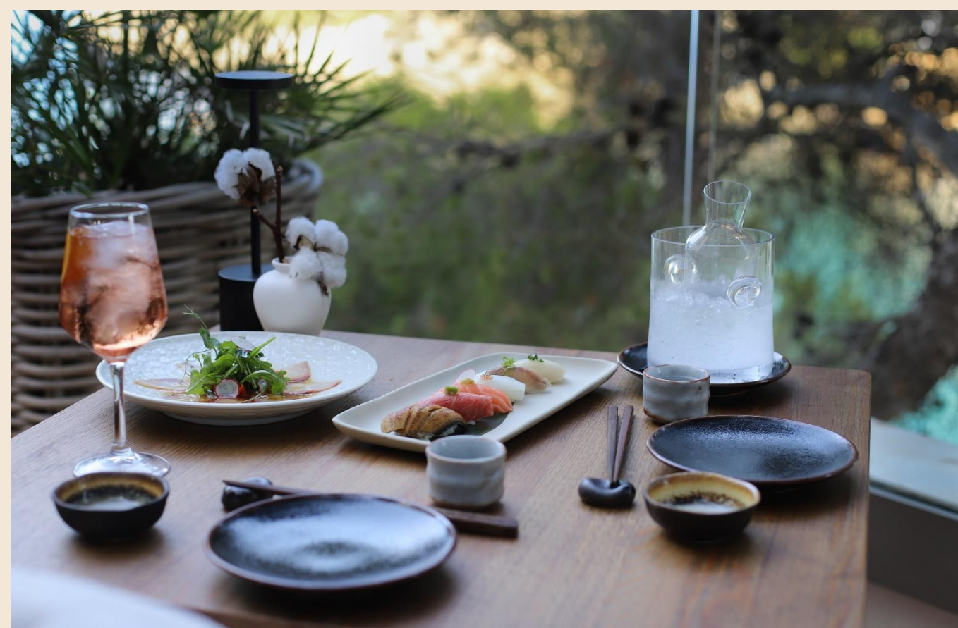
▲ Niko up to 150 people, 50 in the Al Fresco area